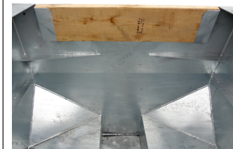
34" Long 2"x8" - Not Provided

The Brackets should be placed in the proper slots depending on if you are using the ME-110 or ME-140 *See image to the left