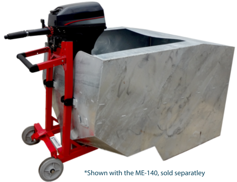
*Shown with the ME-140, sold separately